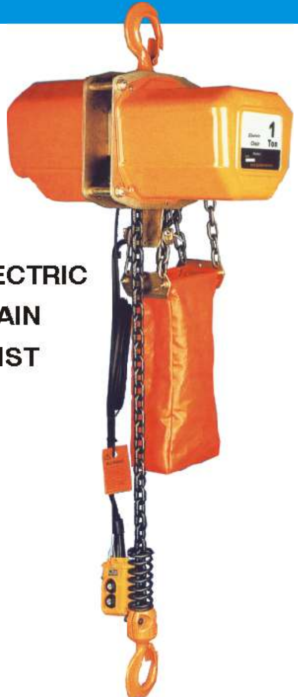
ELECTRIC CHAIN HOIST